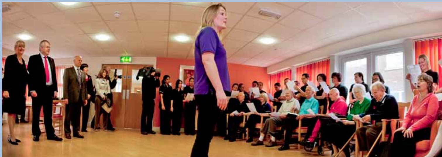
Residents and staff at Bodlondeb singing to The First Minister Carwyn Jones.

"The message seemed to chime with the First Minister and I was very pleased with what he said in terms of putting real value into social care, therapies, art and all of the things that matter to individuals.